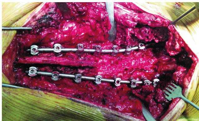
Figure-2: A peroperative photograph showing posterior decompression and pedicle screw fixation.