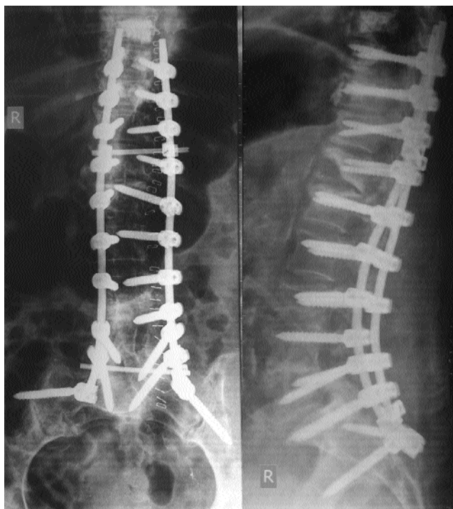
Figure-3 The revision of fixation in a case with failure of fixation at L5-S1 level treated with iliac screws and cement augmentation.