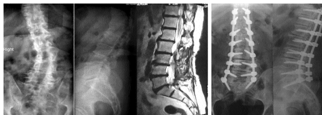
Figure-1: Preoperative and post operative radiographs and magnetic resonance imaging (MRI) scan. Marked correction was achieved after pedicle instrumentation.

Of the 22 cases, 5(23%) were males and 17(77%) were females with an overall mean age of 64 \pm 10.38 years (Range 48-84 years) Decade wise frequency was plotted and most patients were found to be in 6th and 8th decade