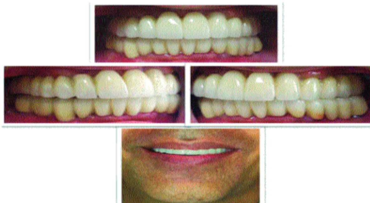
Figure-2: Appearance of the final prostheses.