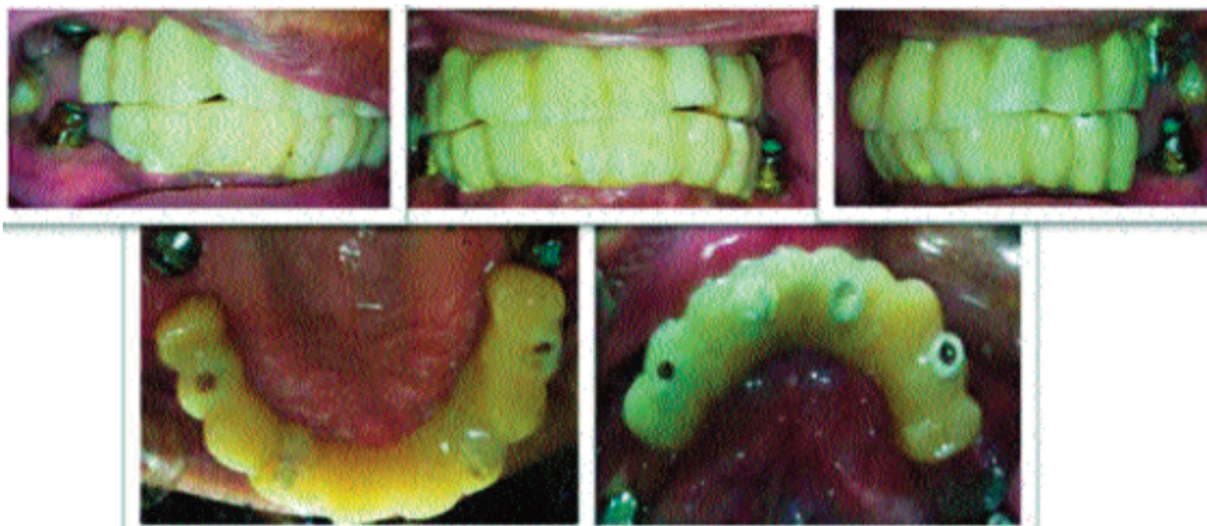
Figure-1: Screw retained upper and lower temporary prostheses extending upto premolars region.

Avoiding the period of edentulism by providing fixed solution in the interim period using teeth and implants in