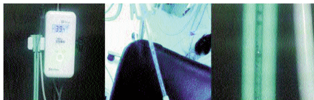
Figure-2: Bubbles in Mediset.

The temperatures of the working area, the liquid before