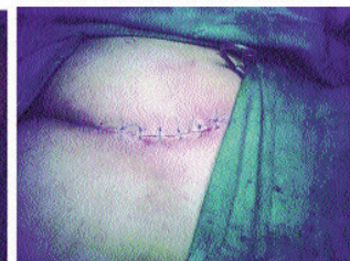
Figure-B: Primary closure with drain