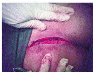
Figure-A: Elliptical excision