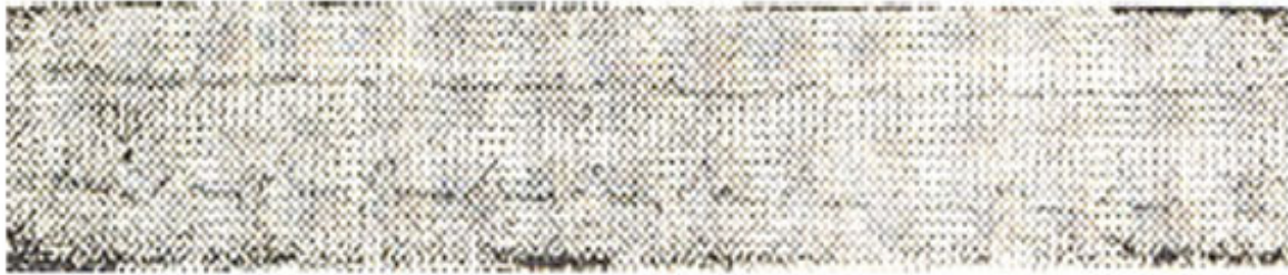
Fig. 1. Mr. S.B.K., a. complete heart block, b. right ventricular endocardial pacing.

On examination nerve deafness and low I.Q. were demonstrated. The pulse was 30 minutes, blood pressure 100,70 syncopal attacks were observed during examination. Investigations: haemoglobin 80%, serum urea 35 mg 100 ml and serum potassium 4.5 meq L. Chest X-ray showed increased cardiothoracic-ratio and electrocardiogram showed complete atrioventricular dissociation with atrial rate 82/min and ventricular rate 30/min and syncopal attacks demonstrated ventricular asystole. Atropine 2 mg administered intravenously showed no effect and response to sublingual and oral long acting isoprenaline was unsatisfactory. In view of recurrent prolonged syncopal attacks a transvenous right ventricular endocardial pacing was carried out on the day of admission, and because of persistent heart block a Medtronic 5944 ventricular inhibited demand pacemaker was implanted on January 13, 1976 (Fig. 1).