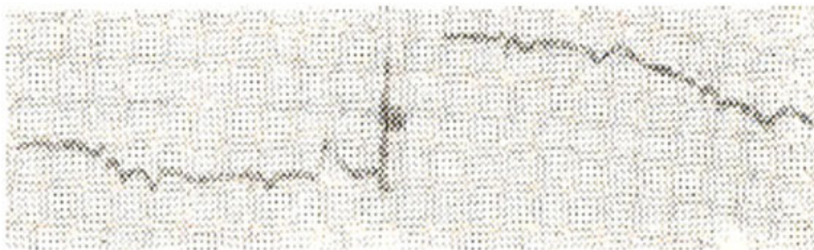
Fig. 5. A male 8 years old deaf-mute boy with syncopal episodes: Lead 2, a. At rest, Q-Tc 0.52 sec., b. After exercise, paradoxically increased Q-Tc 0.60 sec.

One child also demonstrated isolated first degree A-V block (R-R interval 0.2 sec). The long Q-T syndrome (LQTS) i.e. deaf-mutism associated with prolonged Q-T interval and syncope, was found in 4 children (2.3%), Fig. 5.