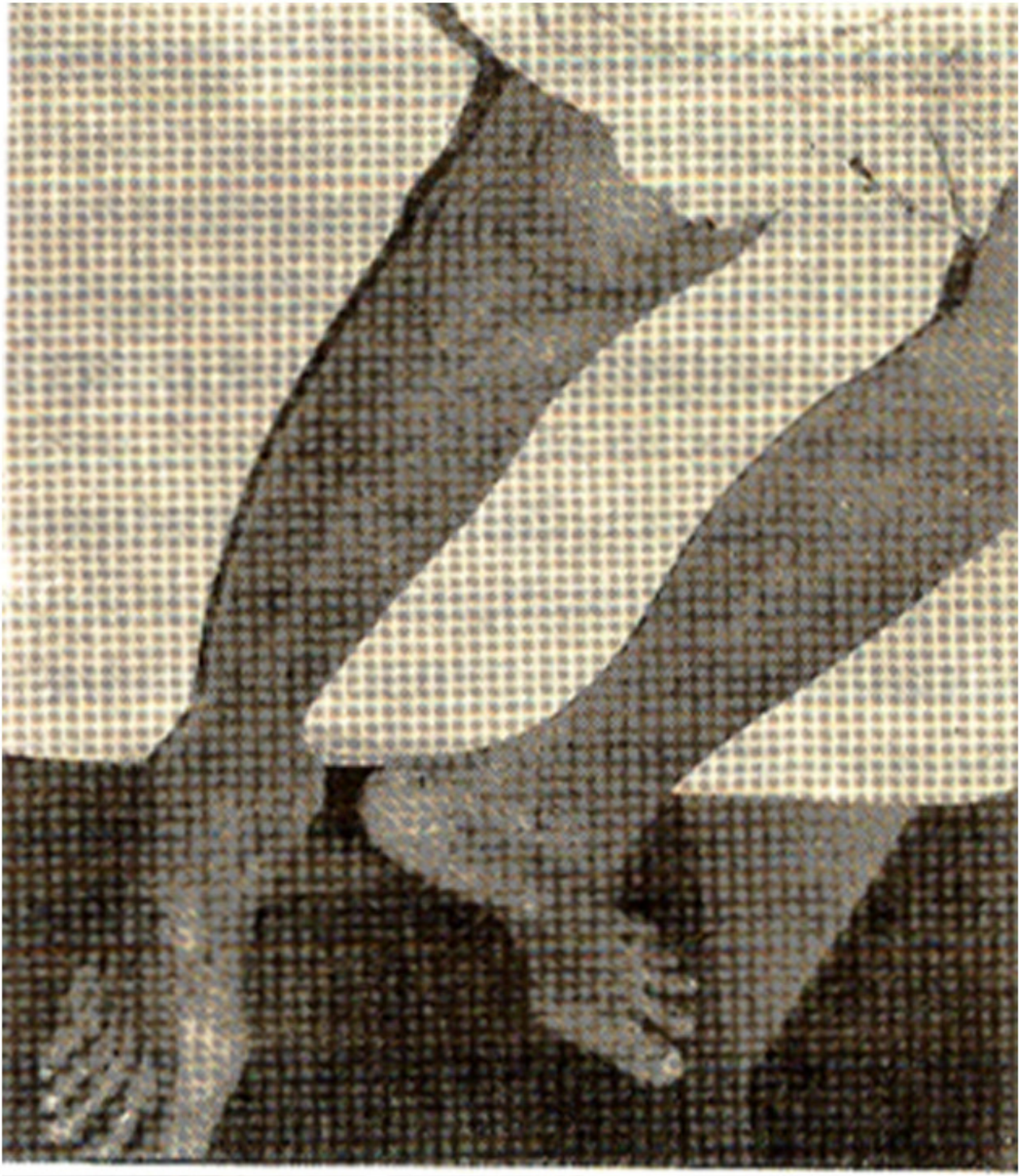
Figure 1. Vasculitic rash on both legs.

Her pulse was 80/mm, blood pressure was 180/100mm Hg in supine position. JVP was normal, there was slight pedal edema, heart sounds were normal, systolic ejection murmur (Grade 2/6) was heard over the precordium. Abdomen was distended, non tender with tense ascites and hence no abdominal viscera were palpable. Bowel sounds were audible. Chest and nervous system examinations were