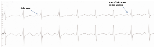
Figure-1: Loss of delta wave (ventricular pre excitation) during radiofrequency ablation. This ECG was recorded during ablation of accessory pathway. Successful ablation of the pathway is manifested on the ECG by loss of ventricular pre excitation (delta wave).

outcome of EPS and RF ablation during this learning curve.