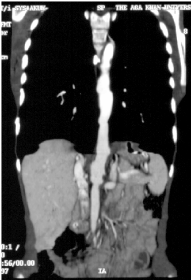
Fig-2A: Coronal reconstruction view.

Reconstruction images above showing irregular aneurysmal dilatation of proximal part of abdominal aorta showing celiac artery, superior mesenteric artery and both renal arteries arising from the aneurysmal portion.