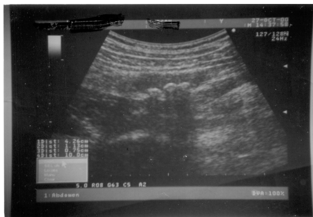
Figure I: An inflamed appendix showing multiple appendicoliths.

96%. 5 The conventional criteria are identification of a non-compressible bowel loop in right iliac fossa with thickened walls that may show an intra-luminal calculus or peri-appendiceal fluid or collection 14 (Figures I and II). Inexperienced operators can not fully elicit its potential. 15 Combining a simple maneuver of clinical skill and ultrasound expertise, a new criterion was developed as 'Detection Of Pin point Tenderness on the Appendix under UltraSonography' and was given the acronym DOPTAUS. 16 The main difference here