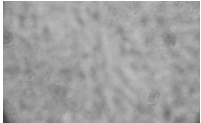
Fig 2: Patient negative NBT test (NBT dye, x40)

When she presented to us, she was a pale looking child with failure to thrive, hepatosplenomegaly and cervical lymphadenopathy. Both her height and weight were below 0.4th centile for her age. Earlier this year (2007), she had been investigated for the fever at Lahore. She had low haemoglobin (8.2 g/dl) with hypochromic microcytic picture and ESR 35 mm/1 hr. Her total leucocyte count was 15000/uL, with 64% neutrophils and 26% lymphocytes. Her serum total protein and globulin were raised (9.81 g/dl and 6.31 g/dl). Excision biopsy of cervical lymph nodes had revealed reactive hyperplasia. Trucut biopsy of right lung showed granulomatous inflammation with aspergillus hyphae. CT scan chest suggested malignant infiltrative process in right upper chest and left lung. We focused on immune status of the patient taking into consideration her clinical and laboratory data. Investigations at AFIP showed raised IgG levels (19 g/dl) with IgA, IgM and IgE levels within the age specific reference range. Anti candida and anti E coli antibody titer were normal (1:160 each). Lymphocyte subset analysis revealed a slight increase in her B cells and NK cells (706/uL and 412/uL respectively), for her age. But her nitrobluetetrazolium (NBT) dye reduction test characteristically revealed absolutely no reduction of dye by neutrophils, as shown in fig 2 (procedure attached as annex 'A'). The percentage of patient's neutrophils stimulated by candida and E coli that reduced the dye was