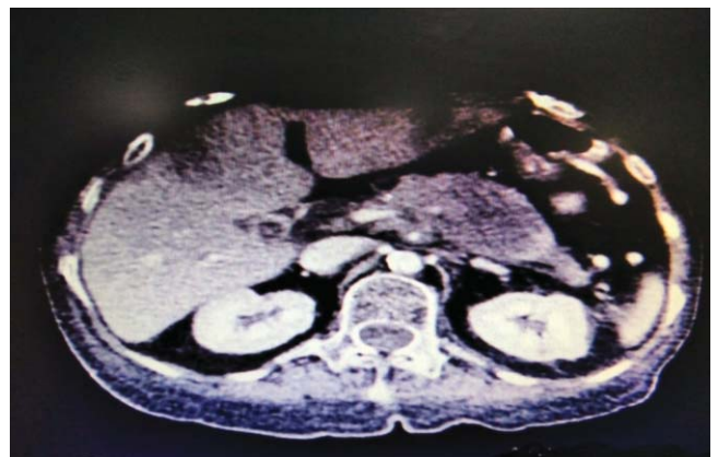
Figure-2: CT of the abdomen showing hypo dense area in the body of pancreas suggestive of pancreatic carcinoma.

Abdominal examination was normal, except for mild tenderness at the right hypochondriac region. Her other examination was normal. Her workup showed haemoglobin of 12 g/dl, WBC count of 21,000/uL and platelets count were 365,000/uL. Potassium was 2.7meq/dl. Chest X-ray showed bilateral, small, multiple nodules typical of miliary pattern (Figure-1). Sputum for culture and sensitivity and Acid Fast Bacilli was sent. Differential diagnosis of atypical pneumonia, pulmonary TB and metastatic disease were made. CT scan of the chest was ordered which revealed few well-defined soft