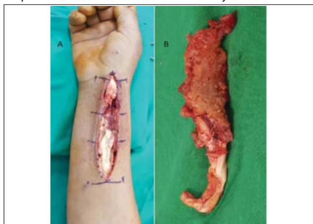
Figure-2: Intraoperative photographs of forearm (A) showing flexor carpi muscle after drainage of pus and debridement of necrotic tissue. Intraoperative photographs of excised flexor carpi radialis muscle.

Treatment comprised of surgical intervention. An incision was made over the swelling and 10 ml of pus was drained. Synovial sheath of the flexor carpi radialis muscle was thick with a gritty sensation on cutting; muscle belly of flexor carpi radialis was necrosed. The clinically involved muscle