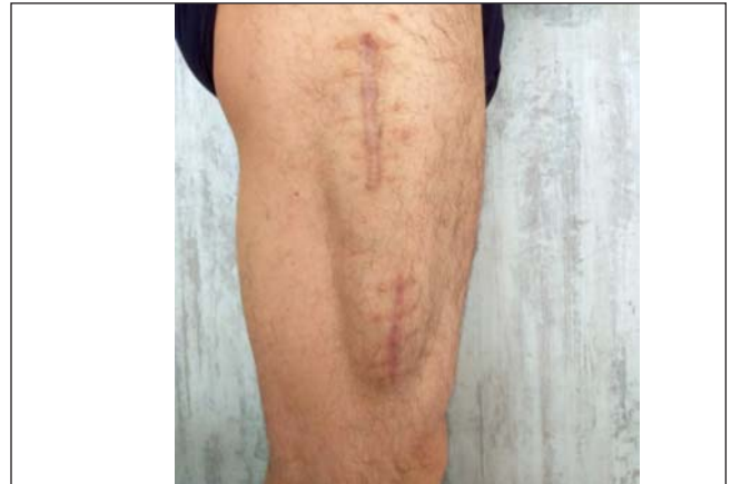
Figure-4: Fasciotomy incision scar with bulging vastus lateralis

Warfarin was restarted. On the same day, the patient had increased swelling of the anterolateral thigh. With severe pain and tension, the patient underwent fasciotomy with a diagnosis of isolated thigh anterior compartment syndrome. After surgery a dramatic improvement occurred in the patient. After wound care for fasciotomy, as tension in the thigh was normal for three days, the incision line was